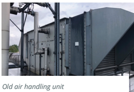
Old air handling unit

With a strict hygiene specification at the food production facility being the top priority, optimum indoor air quality was a key requirement of the air handling units effectiveness for the building operation, as well as ensuring occupant comfort for all its staff. In addition, there was a requirement to reduce maintenance overheads and energy consumption as part of the specification.