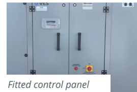
Fitted control panel