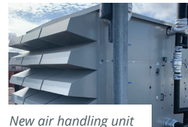
New air handling unit

Each unit was designed with 5no energy efficient direct drive EC plug fans, these consume less energy and are more hygienic than the old belt driven centrifugal arrangement, which required belt changes, to prevent deposits in the air stream.