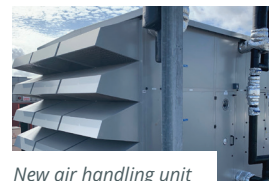
New air handling unit

Each unit was designed with 5no energy efficient direct drive EC plug fans, these consume less energy and are more hygienic than the old belt driven centrifugal arrangement, which required belt changes, to prevent deposits in the air stream.